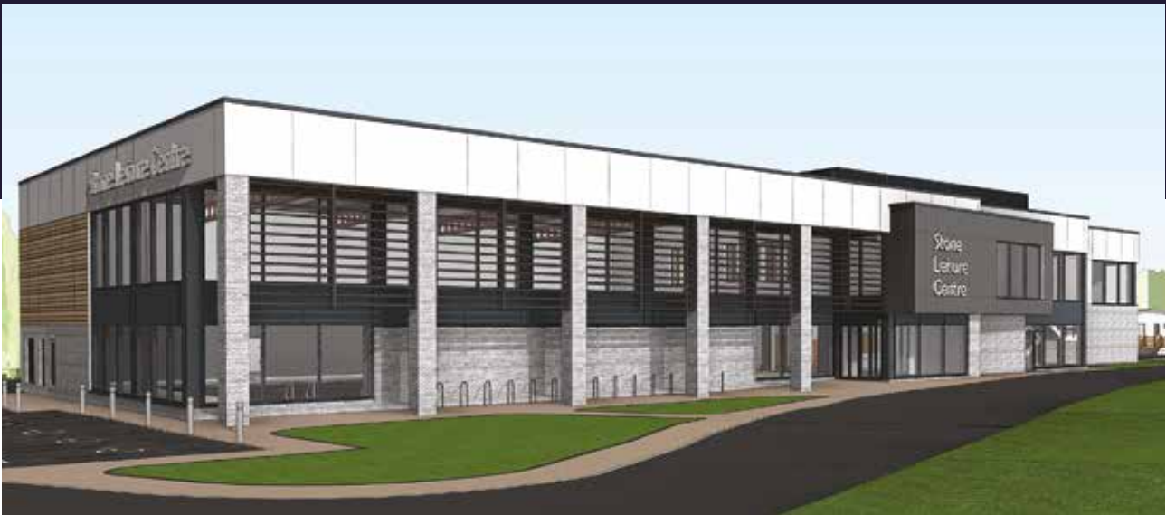
The new planned Stone Leisure Centre will be built in 2018.

The Borough has great transport links and is a pivotal location in the West Midlands region. Stafford as a hub station will boost growth for the area.