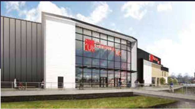
New cinema under construction.