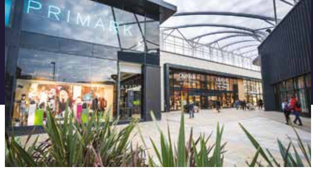
New Riverside retail development.