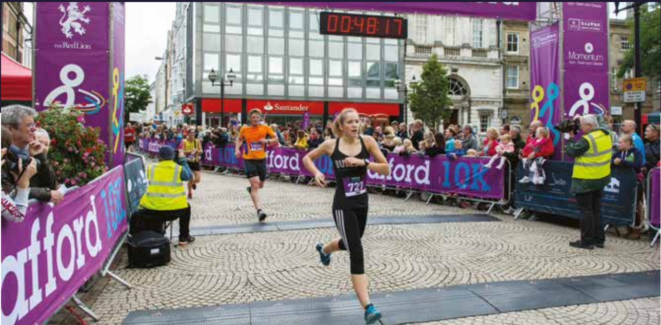
Three quarters of runners in the Stafford 10k said that they would increase their regular physical activity levels following their decision to enter.

Stafford Borough is a safe place to be. We will continue working with our partners to focus on a prevention and early intervention approach to tackling crime and anti-social behaviour.