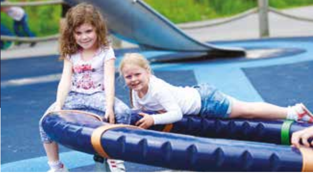
Victoria Park, Stafford.