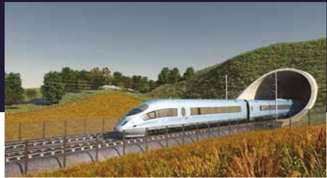
High speed trains will stop at Stafford station.