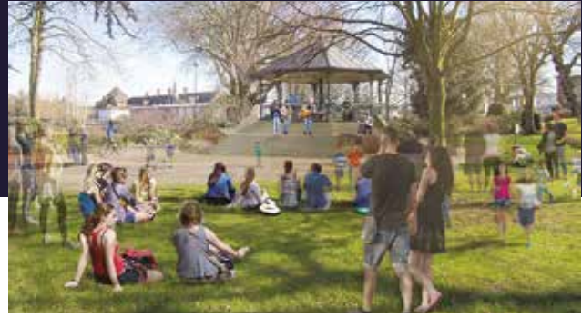
Planned £2.5million investment in Victoria Park.