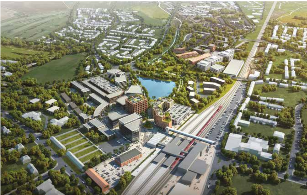
Proposals for Stafford Gateway.

HS2 trains stopping at Stafford station will mean that the town is only 50 minutes from London, 20 minutes from Birmingham and 30 minutes from Manchester. Local people will be able to live and work in Stafford and do business in our capital city and enjoy a great quality of life. We have undertaken master-planning to show how the land adjacent to Stafford station could be developed to provide 28 hectares in a prime location to develop a new hotel, an office quarter, urban style live/work housing and high quality public spaces for people to meet and enjoy. Stafford Station Gateway is within easy walking distance of Victoria Park and the town centre and its development would boost town centre businesses. We will continue to identify and develop new opportunities to maximise the benefits of HS2 for the borough.